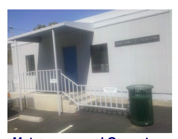
Maintenance and Operations Located at 2121 16th Street West of Corsair Field

Community members who encounter faulty locking mechanisms should phone the Facilities department or SMC Police and Safety to ensure prompt repair or replacement.