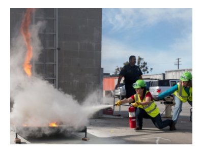
Campus CERT Team III

The safety and security for students and staff of the Santa Monica Community College District is a priority. As part of the Disaster Resistant California Community Colleges consortium and