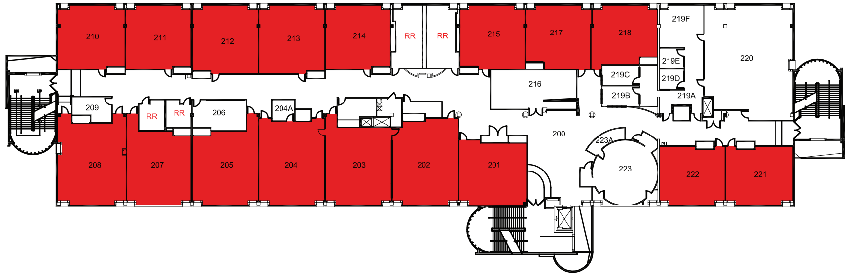
Illustration revision 7-12-23