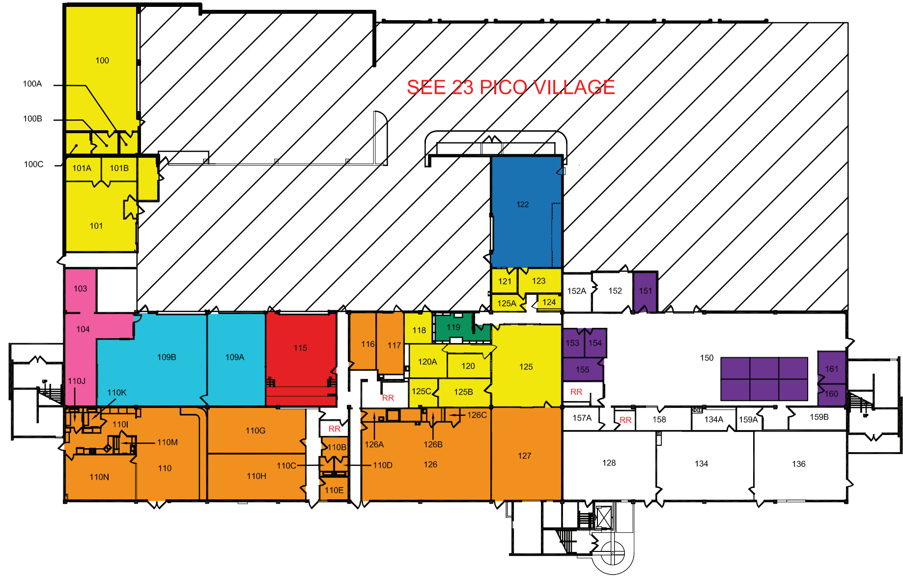
Illustration revision 7-12-23