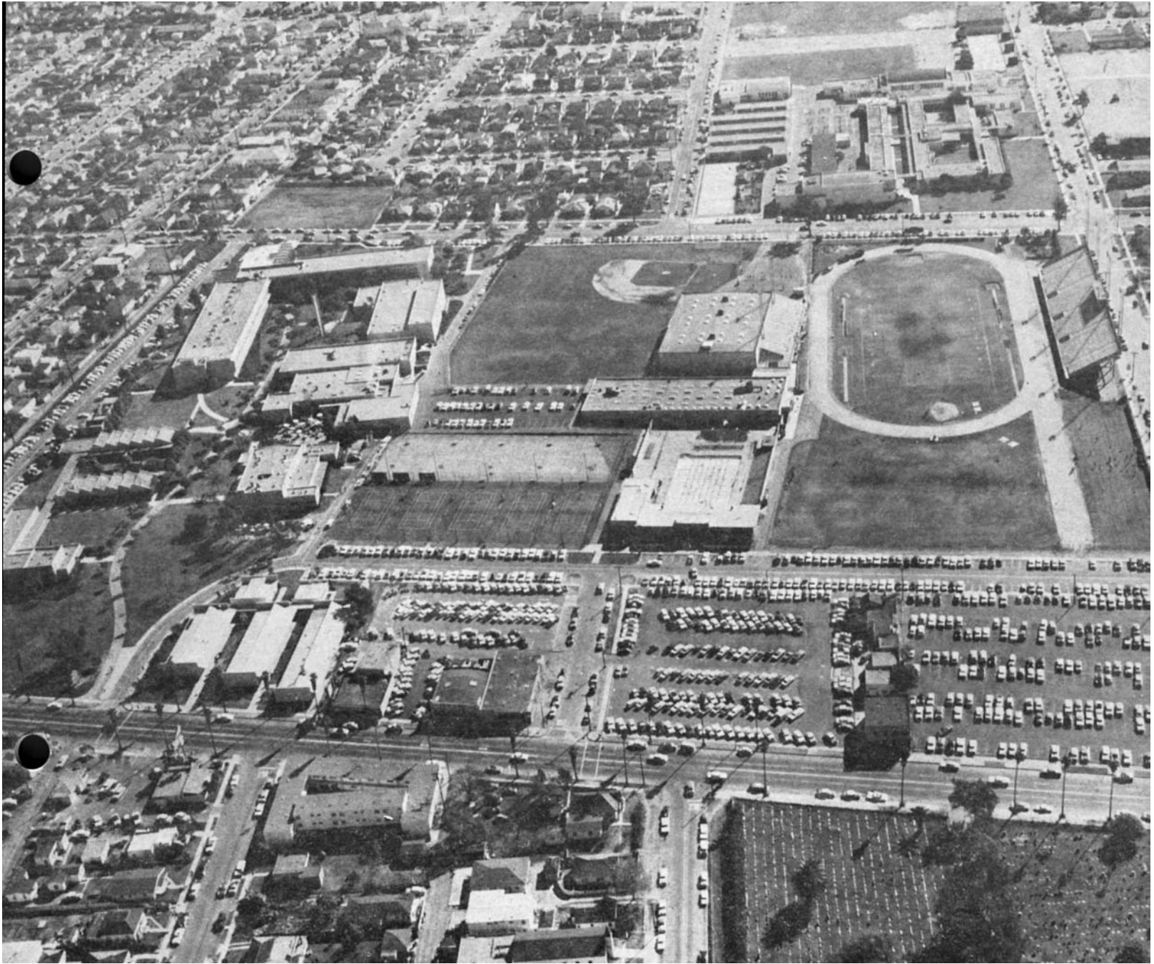
Main Campus, circa 1962