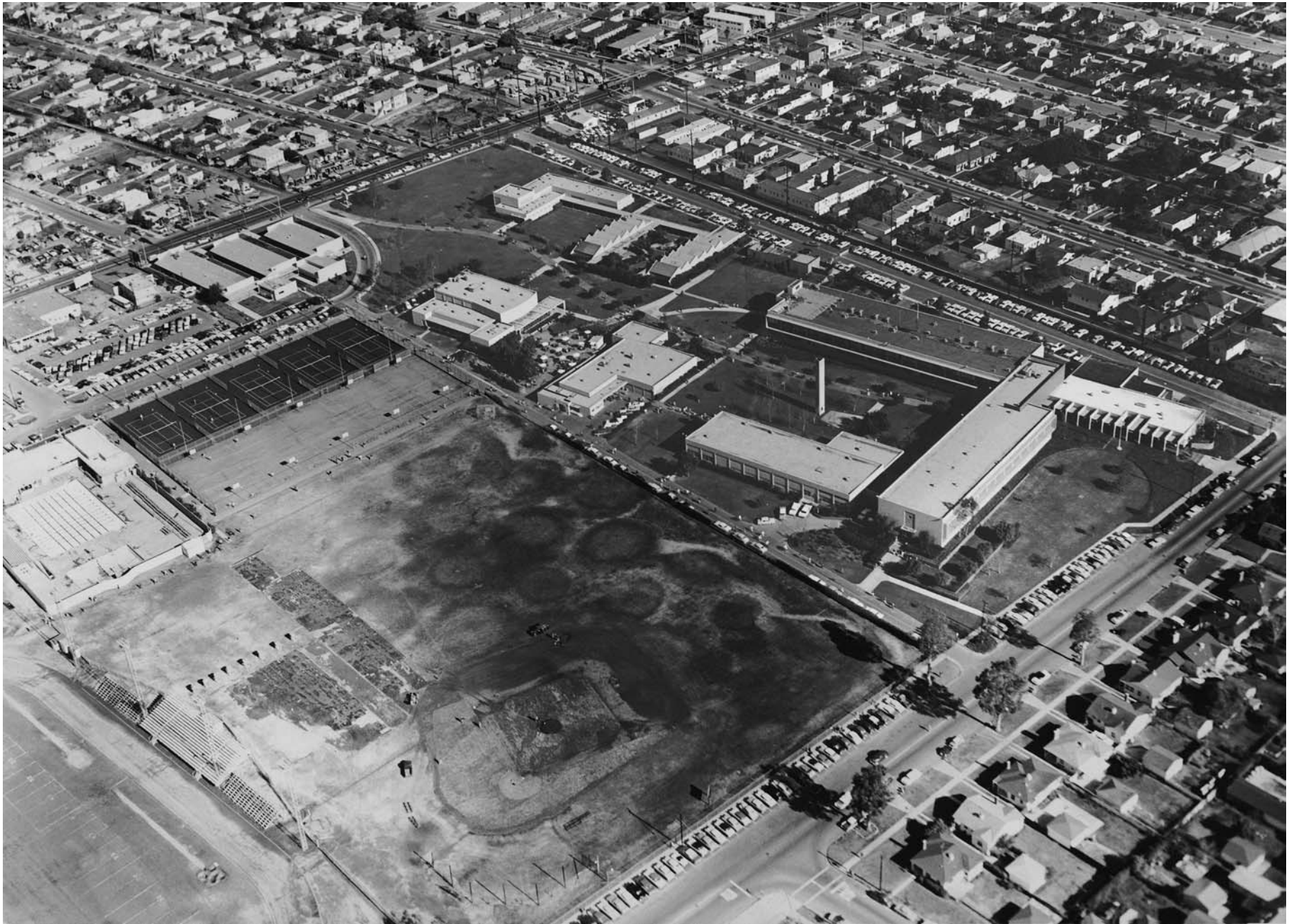
Main Campus, circa 1957