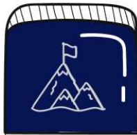
Vision for Success Metric

Description: Among students who had an enrollment at SMC in the selected year, the number who earned a Chancellor’s approved credit Certificate of Achievement at SMC in the same year.