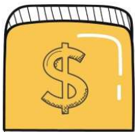
Student Centered Funding Formula