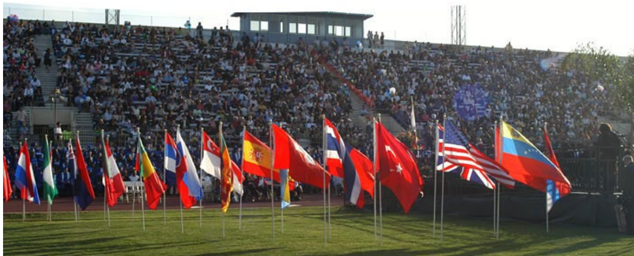
Graduates at Santa Monica College's commencement ceremony.