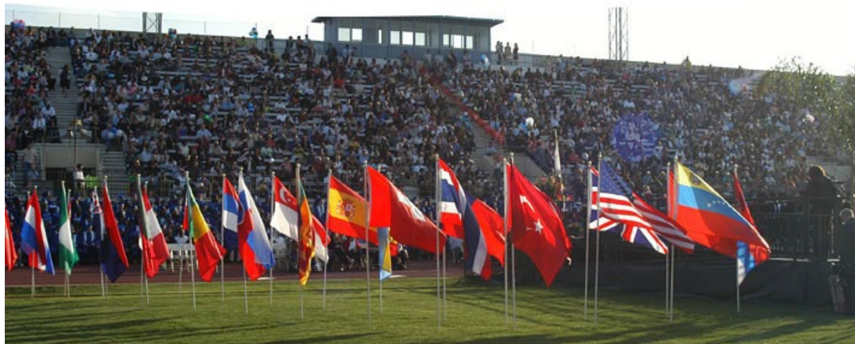
Graduates at Santa Monica College's commencement ceremony.