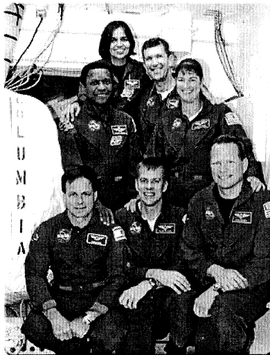
The crew of Space Shuttle Columbia Kneeling in front are (left to right) Payload Specialist Ilan Ramon of Israel, Pilot William "Willie" McCool and Mission Specialist David Brown. Standing in back, left to right, are Mission Specialists Michael Anderson and Kalpana Chawla, Commander Rick Husband and Mission Specialist Laurel Clark.

The next regular meeting of the Santa Monica Community College District Board of Trustees will be Monday, March 3, 2003 at 7 p.m. (5:30 p.m. if there is a closed session) at the Santa Monica College Madison Campus, 1310 – 11 th Street, Santa Monica, California.