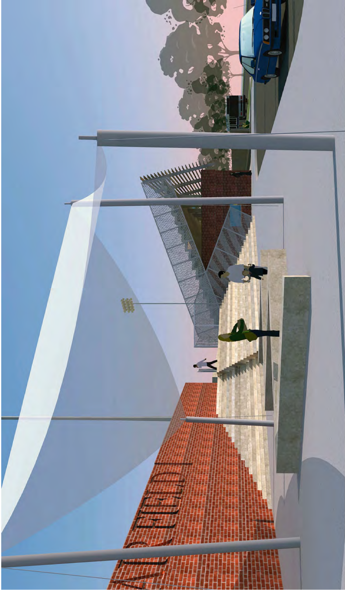
Drop Off Plaza: Stair and Canopy