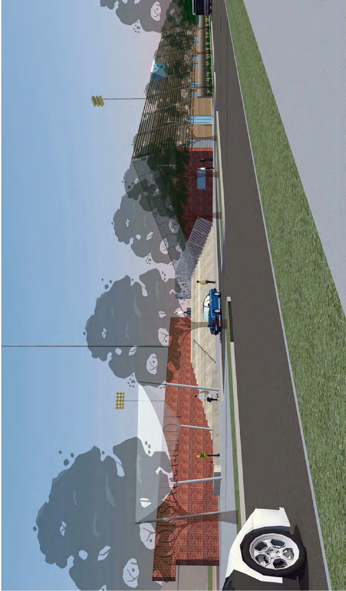
Santa Monica College Corsair Field Grandstand