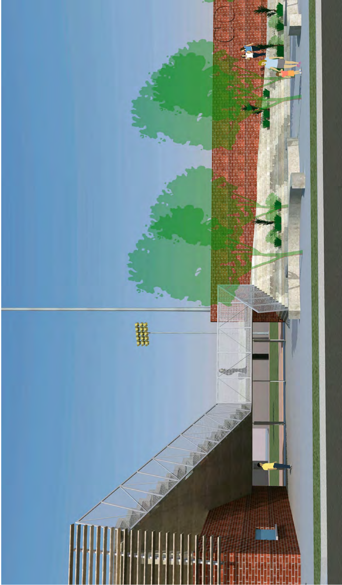
Santa Monica College Corsair Field Grandstand