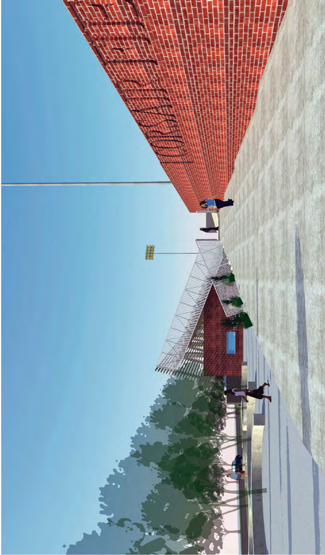
Santa Monica College Corsair Field Grandstand