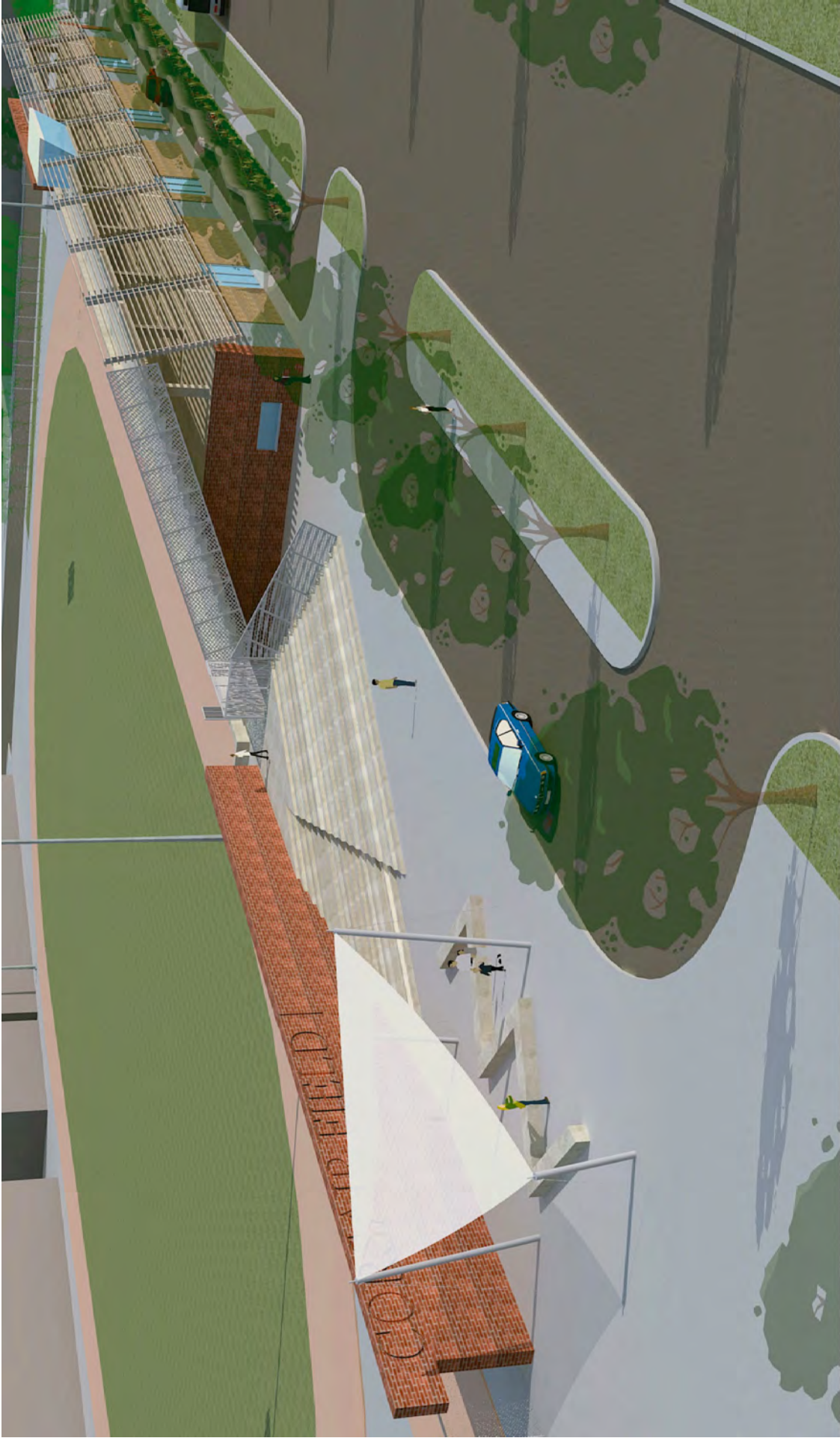
Santa Monica College Corsair Field Grandstand