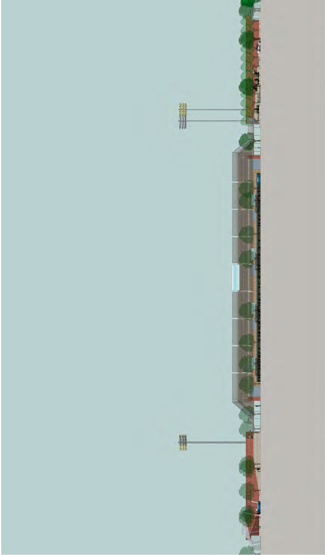
Santa Monica College Corsair Field Grandstand