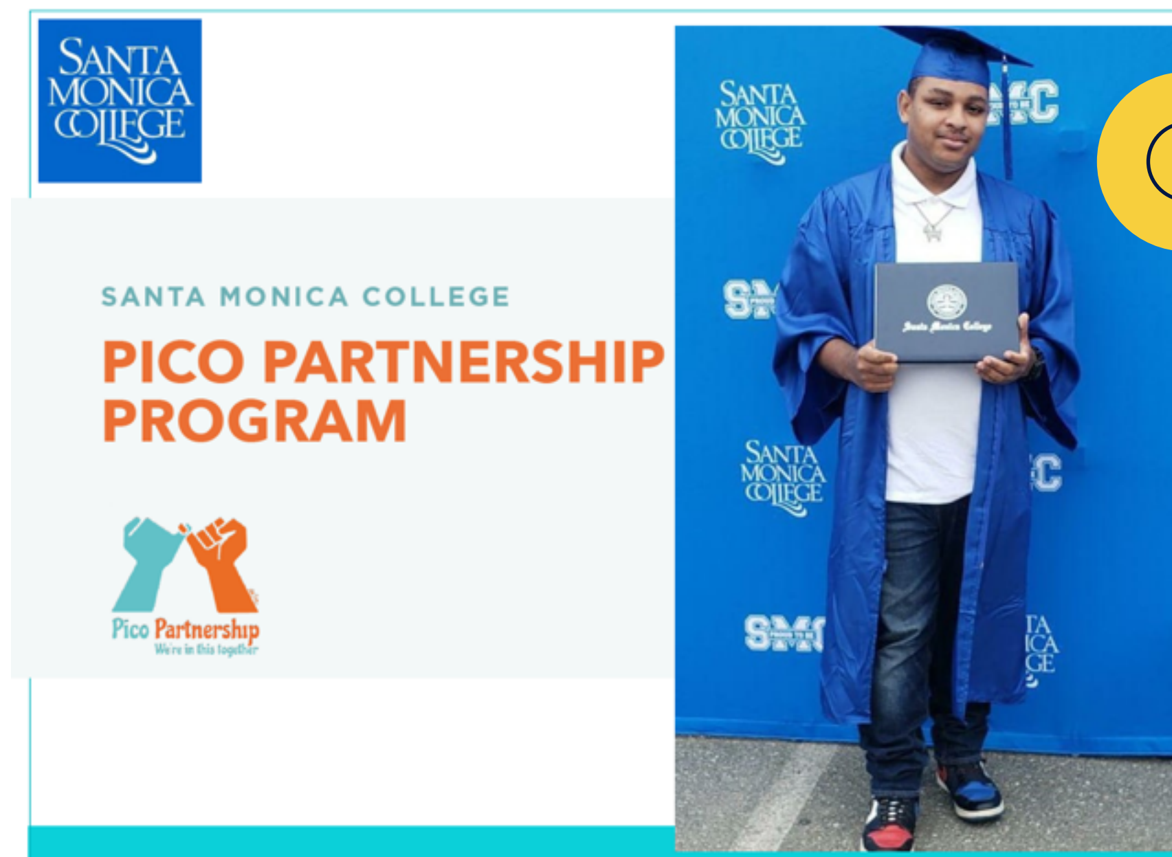
About Pico Partnership

Pico Partnership program is a joint partnership between Santa Monica College and the City of Santa Monica. The program is designed to meet the needs of the under-resourced youth living in close proximity to the college. The program assists and motivates young residents of the Pico neighborhood to pursue postsecondary activities leading to degrees, certificates, transfer to a 4-year university, and/or employment.