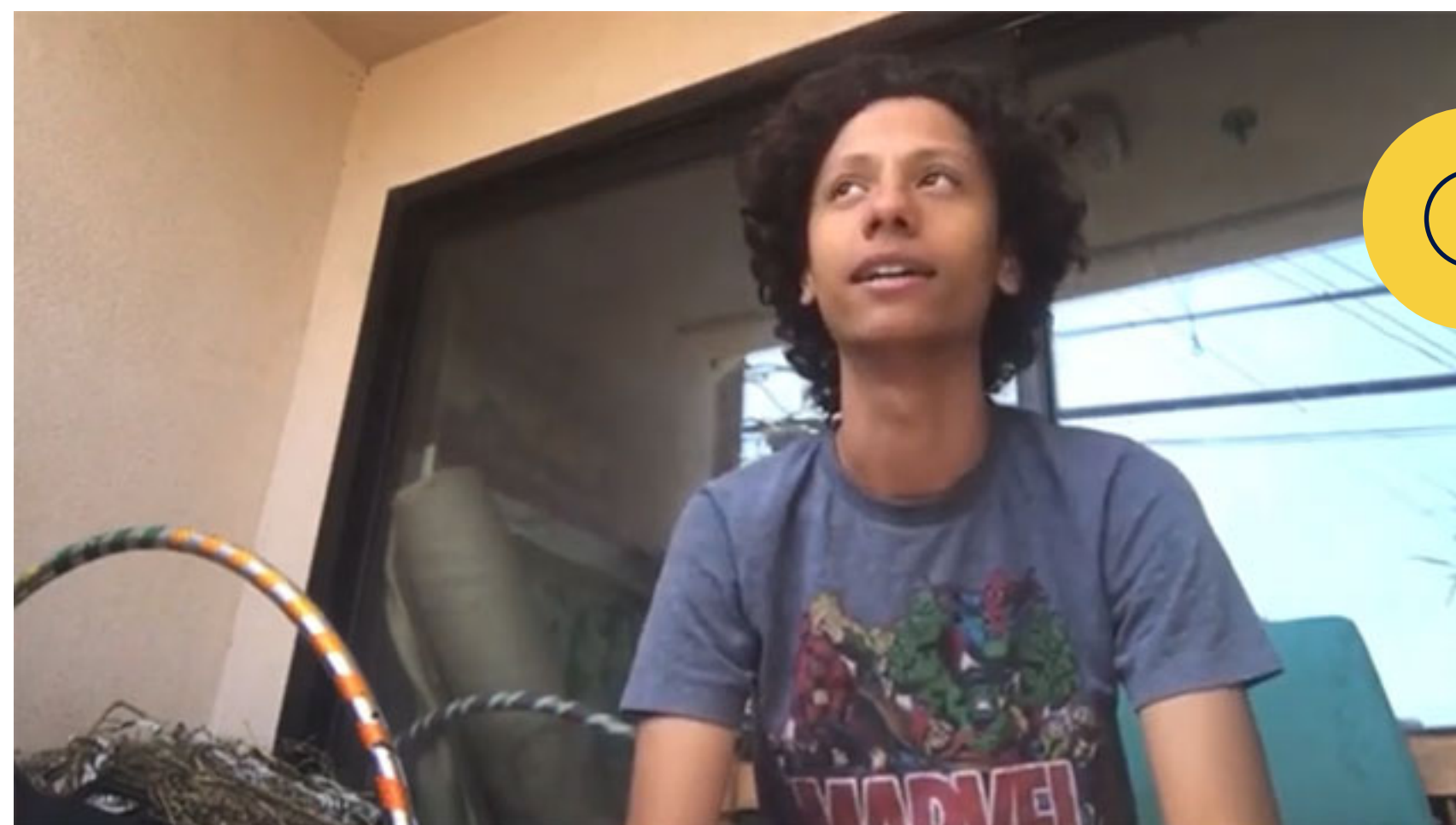
Pico Partnership Alumni