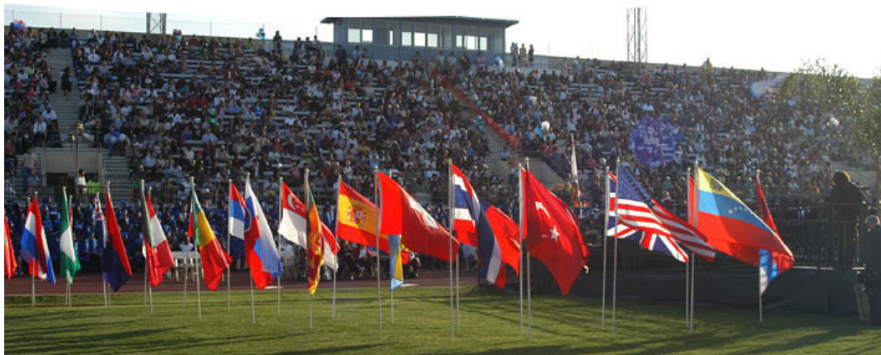
Graduates at Santa Monica College's commencement ceremony.