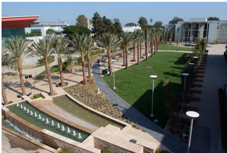
Figure IIIB-2: The Santa Monica College Quad (During and After Construction)

and parking facilities. Another project developed through the planning process is the transportation partnership, “Any Line, Any Time,” among the College and the City of Santa Monica's Big Blue Bus, which allows students, faculty and staff to ride city buses for free.